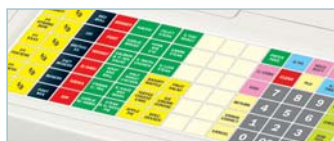
Flat splashproof keyboard with 60 PLU's