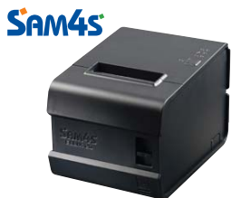
Add an Ellix 20 Thermal Bill Printer to your ER-390M