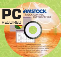
Add Samstock Stock Control Software to your PC.