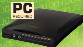
Add a Modem to your ER-390M for remote PC. comms