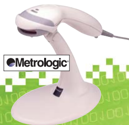
Add a Voyager Bar Code Scanner to your ER-390M