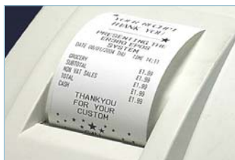
57mm Wide Thermal Receipt from Single Station Clam Shell Printer