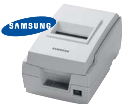
Add an SRP-275A Kitchen Printer to your ER-390M