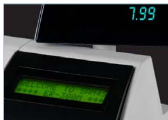
2 Line Operator Display and 10 Digit VFD Customer Display